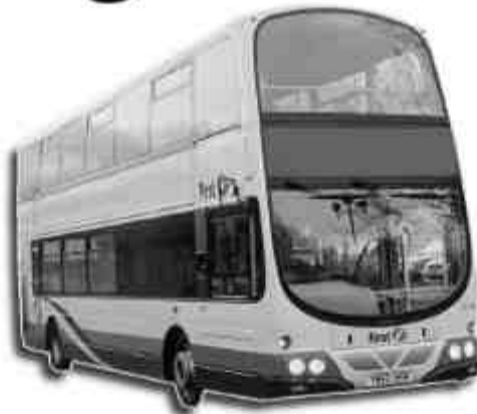
● The Lib Dems are frustrated that the Labour government will only support buses and not trams

"It's a real frustration that the Government won't support new tram schemes at the moment - buses it'll have to be!"