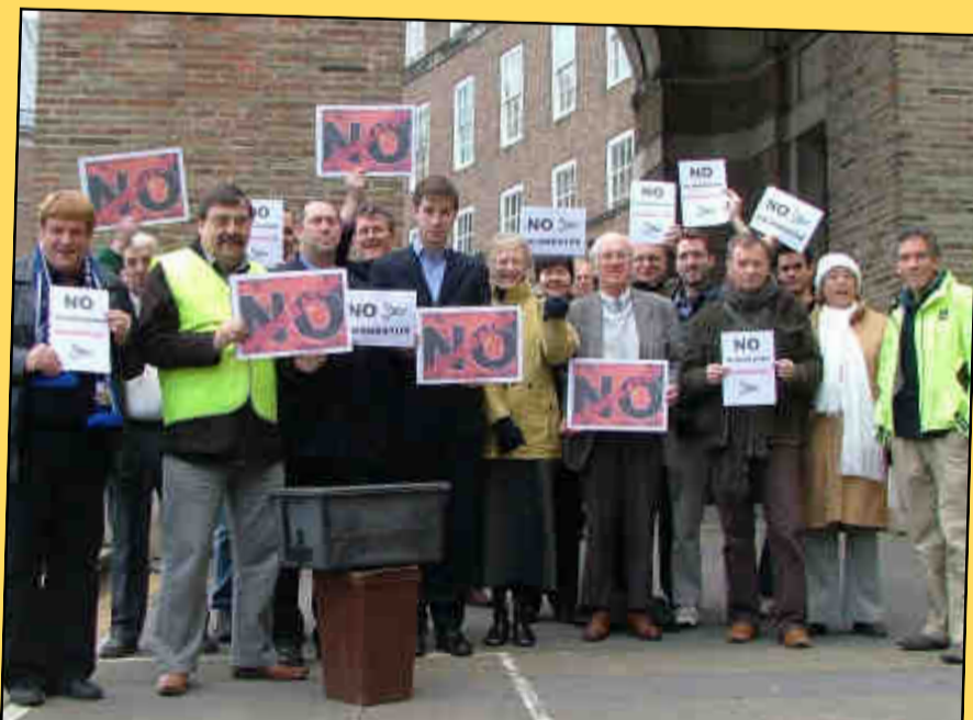
The Lib Dems and environmental groups are opposing the Labour and Conservative plan for a dirty, polluting and inefficient incinerator in Bristol

THE LIB DEMS HAVE VOWED to step up their campaign against a mass-burn incinerator in Bristol.