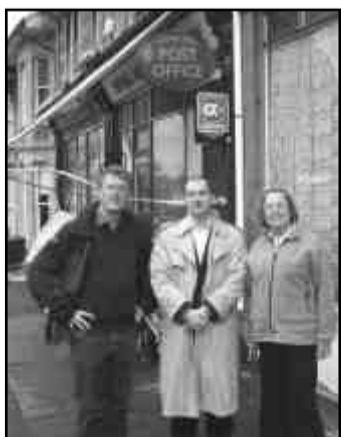
Lib Dem Stephen Williams MP has been fighting to save Bristol's Post Offices from Gordon Brown's axe, including this one just off Gloucester Road

Lib Dem MP Stephen Williams says, "Labour is just letting our Post Office network go to wrack and ruin. However, it is also important to remember that it was the last Conservative government that started this closure programme back in the mid 1990s."